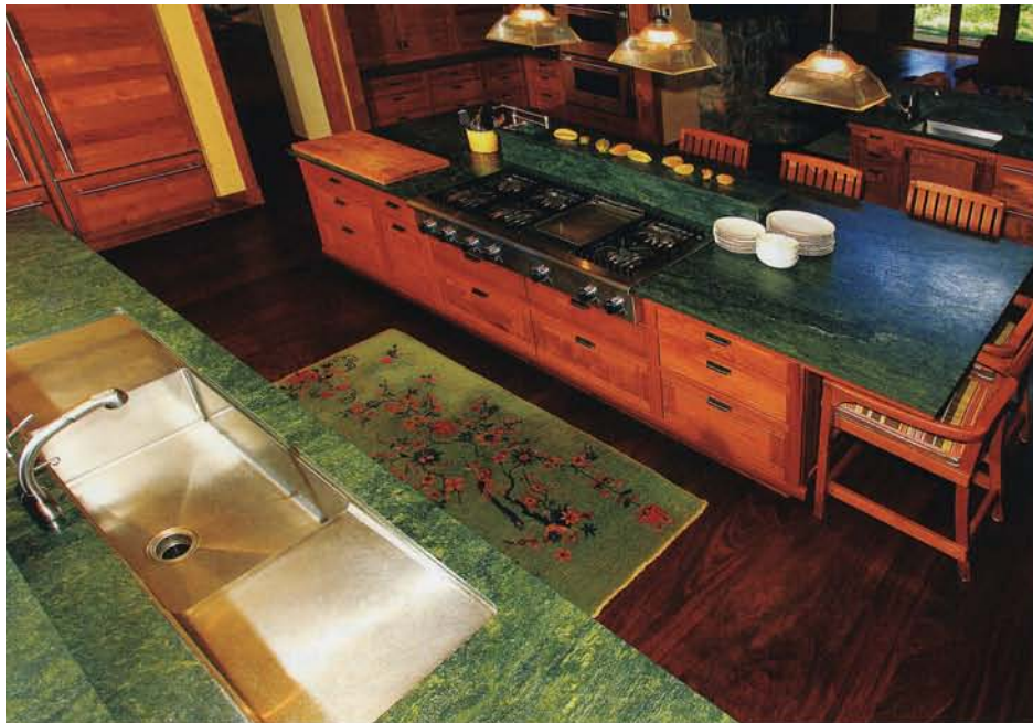
Anuheia's gourmet kitchen features an open layout and top-of-the-line Sub-Zero and Thermador appliances.