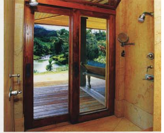
The grounds of Anuhea (pictured below) are nestled within a 1,500-acre gated preserve complete with natural pools and lush tropical landscaping offering the ultimate in privacy. Interiors (above) feature wood, limestone and marble from Bali, France and Panama.