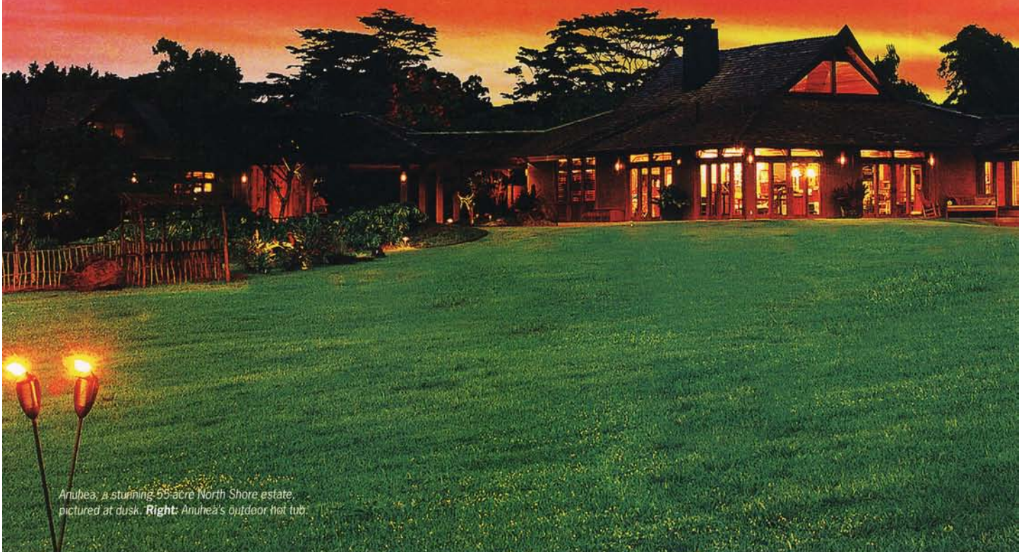
Anuheā, a stunning 95-acre North Shore estate, pictured at dusk. Right: Anuheā's outdoor hot tub.