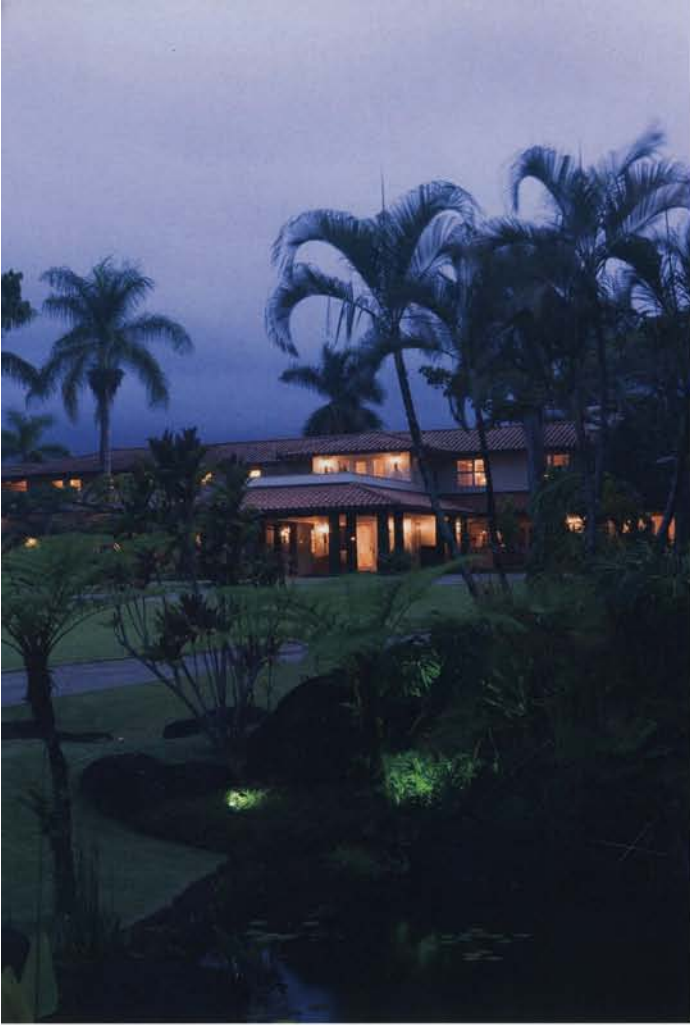
Elegant and understated luxury is enjoyed at Kalihiwai Ridge.